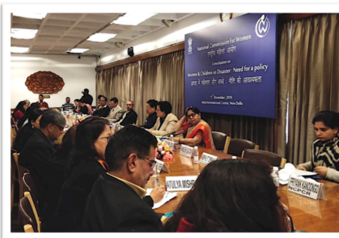
Glimpses from the Consultation Meeting