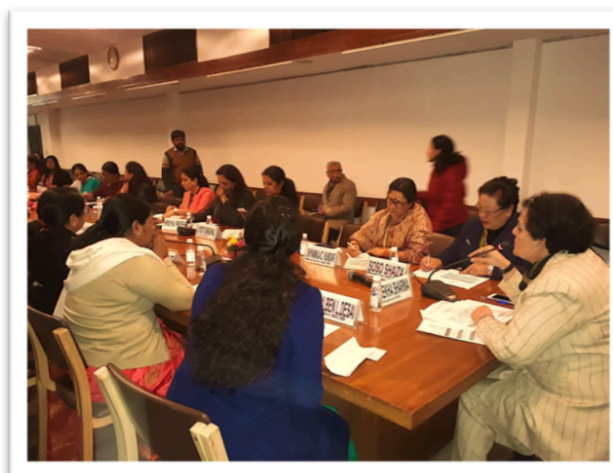
Glimpses of NCW Chairperson Engagement in December, 2019