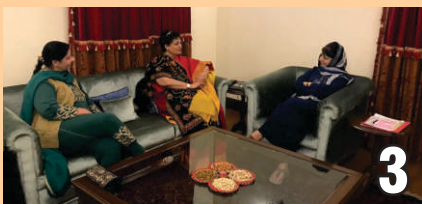
Gender sensitisation in J&K