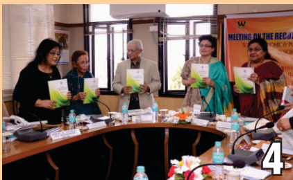
Job creation and skill training for NE women