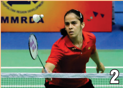
Saina Nehwal bounces back claiming her 3 rd National title