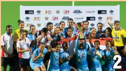
Indian women's hockey team lifts Women's Asia Cup Hockey title