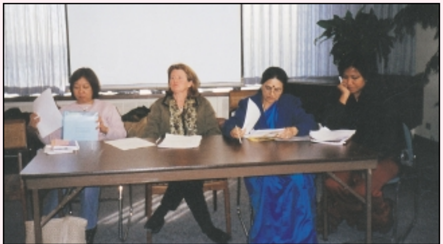
Dr. Girija Vyas (third from left) Chairing the Asia Pacific Conference.